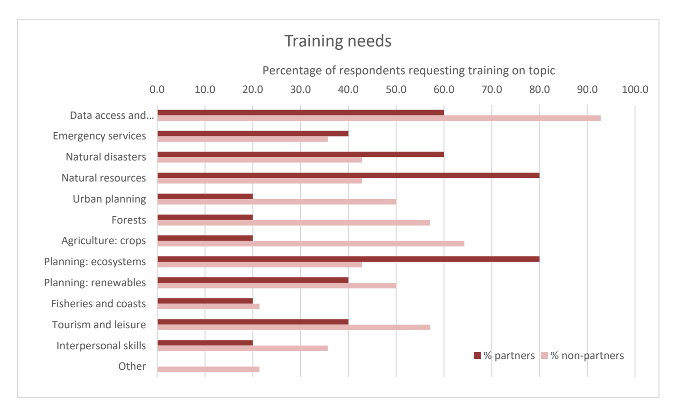
Figure 1. Percentage of respondents requesting training on suggested topics.

The results of the survey are presented in figure 1, below, in which responses from CoRdiNet partner Relays are shown separately to those from other respondents. Copernicus Relays from both groups are interested in further training on data access and management. Training on the use and benefits of Copernicus for natural resources and planning ecosystems scored especially high for consortium partners.